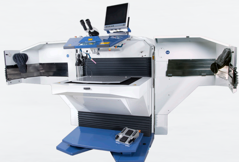
ALW 450 F open