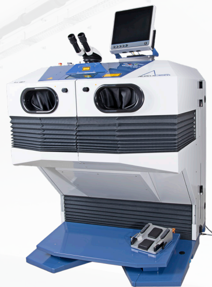
ALW 450 F

The closed, laser-safe enclosure makes the ALW a laser-protected workstation that can be used in the normal production environment without any additional safety precautions. We have again reinforced the laser protection by metal lamellas behind the bellows. In addition, the system meets the high security requirements for performance level d.